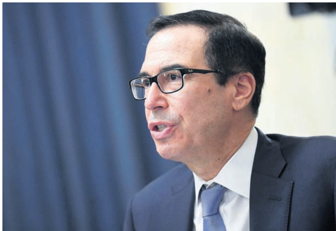
Treasury Secretary Steven Mnuchin speaks during a Senate Small Business and Entrepreneurship hearing to examine implementation of Title I of the CARES Act, Wednesday, June 10, 2020 on Capitol Hill in Washington.

Democrats say they are not receiving enough information about the loan disbursements and fear the Treasury Department has